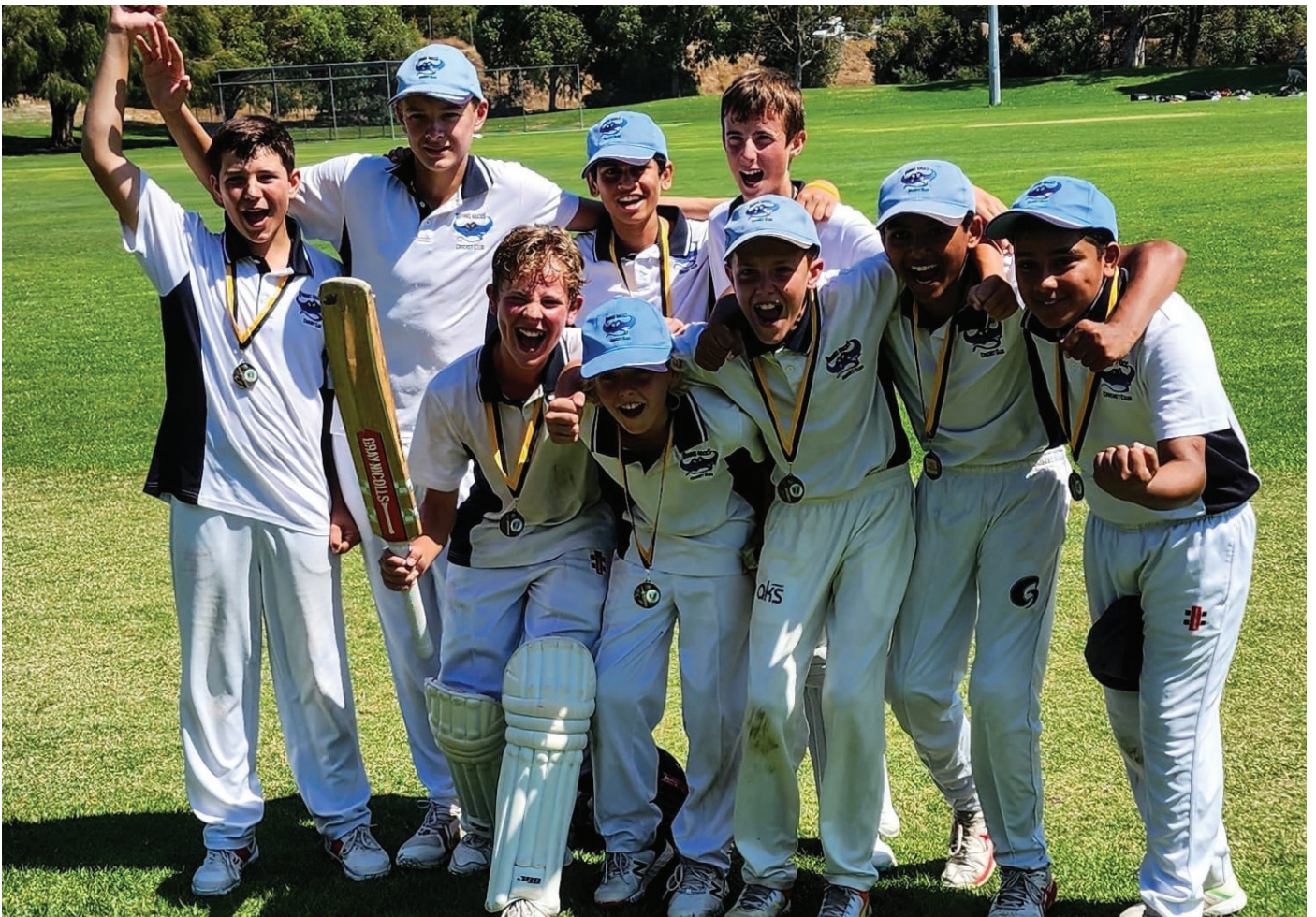
Year 7 White Grand Final winners