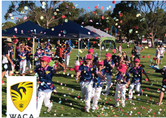
2017/2018 - WACA Growing Cricket for Girls Award