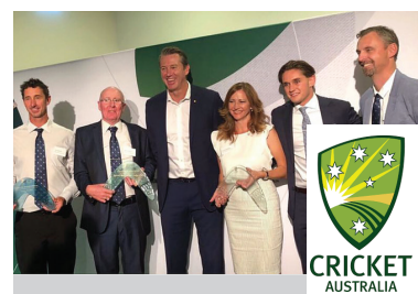
2019 Cricket Australia's 2019 A Sport For All Awards Winners of: The Community Cricket Club of the Year Junior Cricket Program