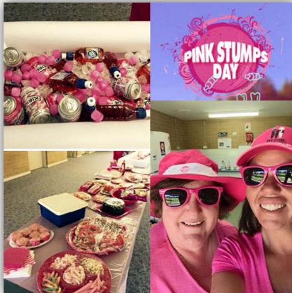
Under 15 Blue supporting the McGrath Foundation.